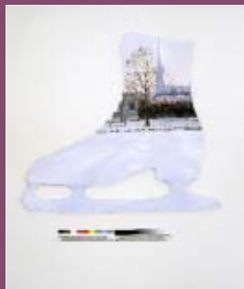
"Ice Skate" by Roger Welch features a view of The Presbyterian Church in Westfield from the pond at Mindowaskin Park.