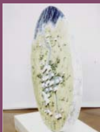
"Opposite Sides of the Earth," 2003 by Roger Welch (view of one side - Amsterdam Island).

Please send A&E news to: ae@goleader.com