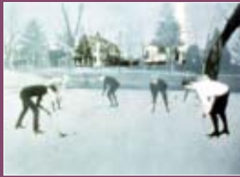
"Mindowaskin Park" by Roger Welch (ink on photographs, 1979).